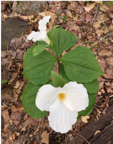
Large-flowered Trillium / Trillium grandiflorum

Here are some photos from my property of wildflowers you might find: