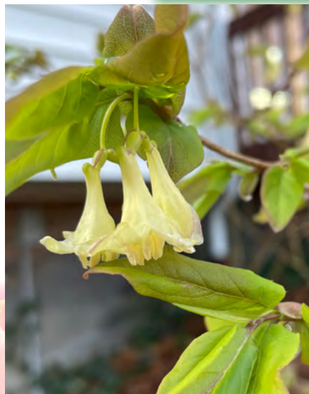
Fly Honeysuckle / Lonicera canadensis , an early blooming shrub