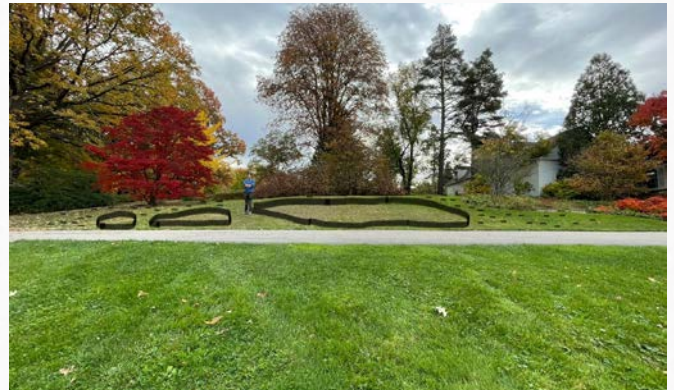
Daffodil Bed - Planning