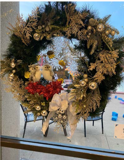
GoGC's Wreath at Cleveland Botanical Garden's 'FROST'.