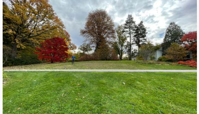
Daffodil Bed - Before

I welcome everyone out in the springtime to enjoy the adopt-a-bed and newly planted 2000 bulb daffodil display near the Lantern Court that was sponsored by the Garden From the Heart grant! Without the clubs help, this would likely not have been possible. I will communicate a concrete date for a tour as spring approaches. Throughout the past year, I have really enjoyed getting to know club members and bouncing my gardening and education ideas off other inspiring professionals. You all have helped develop the foundation of the Lantern Court gardening community and have inspired me to always strive for more as a horticulturist!